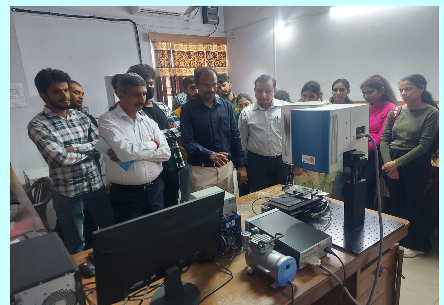
Two-day Workshop on 'Internet Of Things and Artificial Intelligence' to commemorate National Science Day on 28<sup>th</sup> and 29<sup>th</sup> February 2024