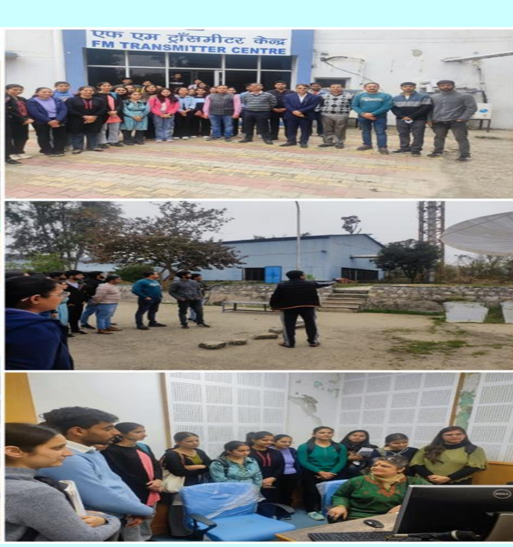
Department of Electronics, University of Jammu organised a one day field visit to All India Radio Station, Jammu on 13 March 2024.