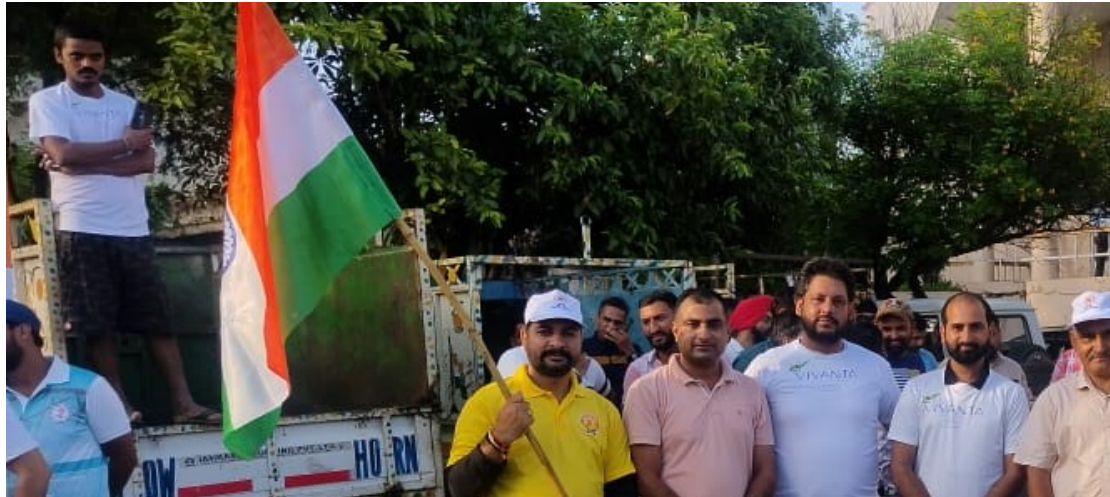
During Tiranga Yatra