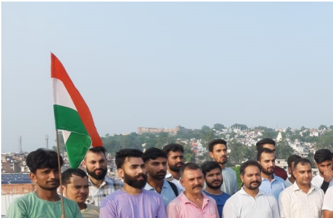
Flag Hoisting on the eve of Independence Day