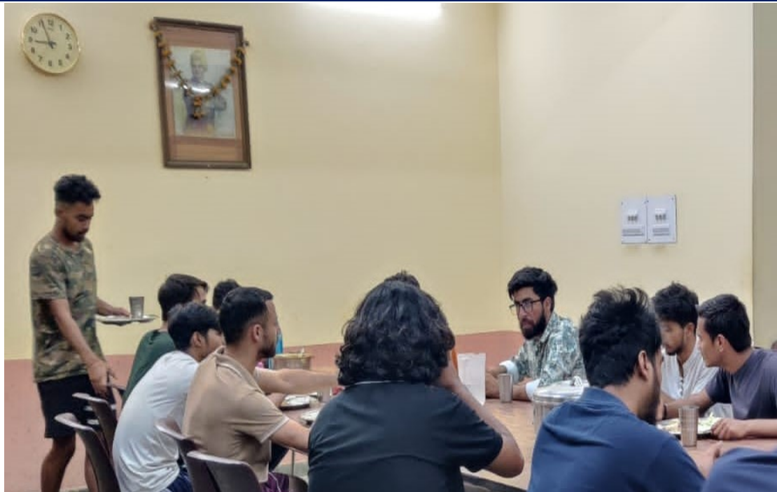
Both Warden and Resident warden during routine visits on dinner time inside mess 9:30PM).