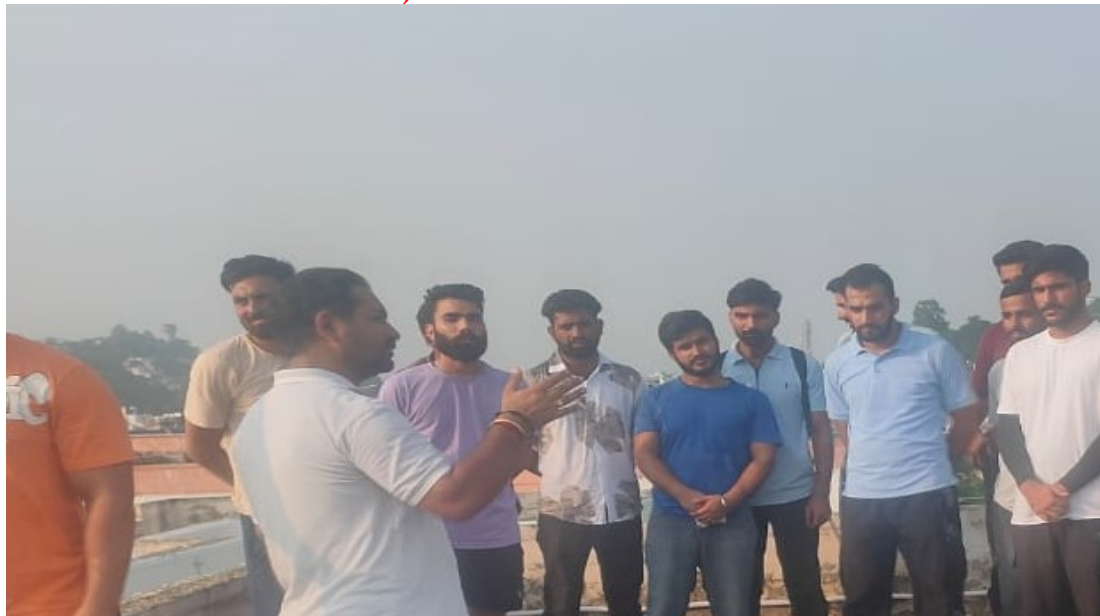
Discussing the “Freedom Fighters as our Heroes” with Boarders of the Hostel