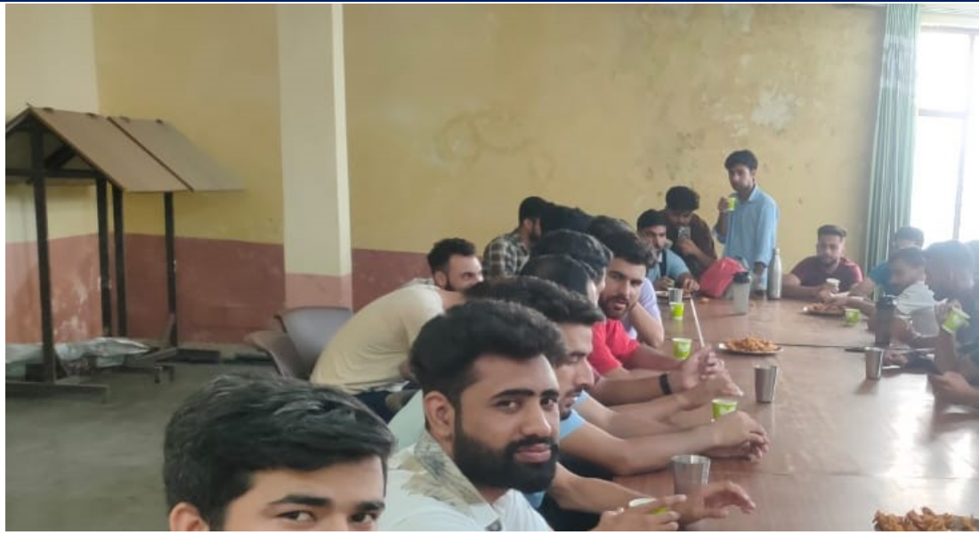
During meeting with the boarders regarding “Zero tolerance against Ragging”