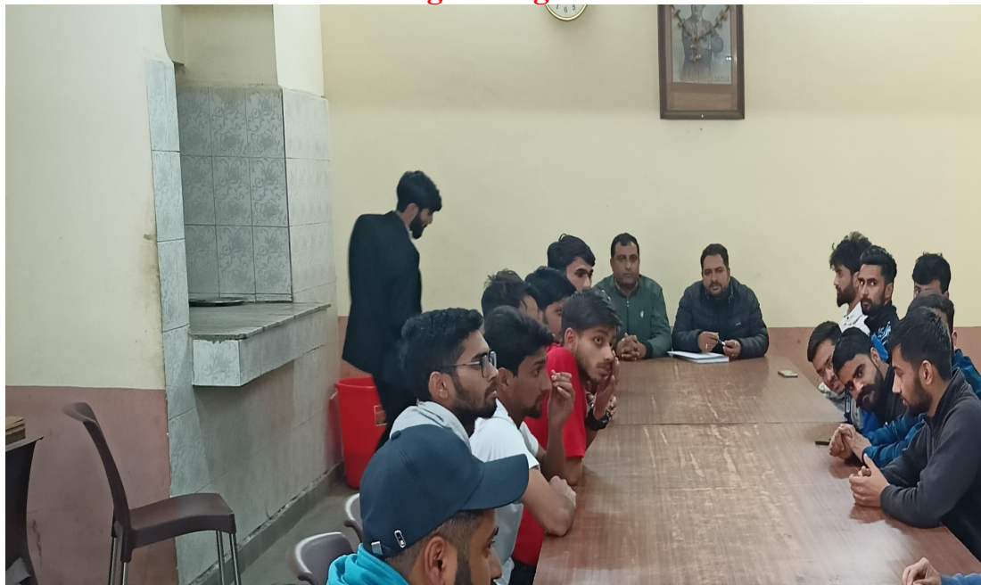
Discussing issues with the boarders and formation of various Hostel committees