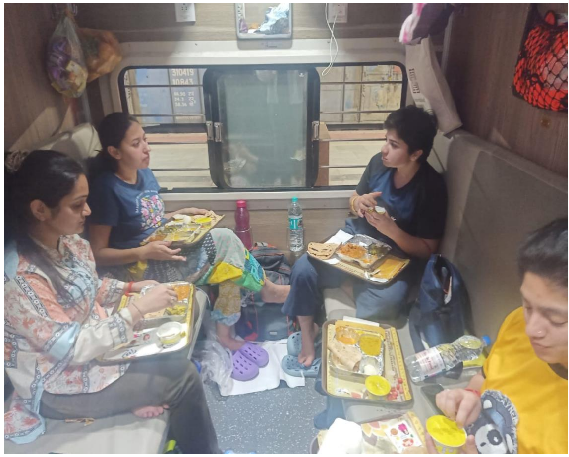
The train became a platform for not just physical but also