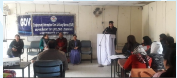
“Career Planning After Graduation” at Govt. Degree College, Bishnah on 30th January 2019 in which 95 students participated.