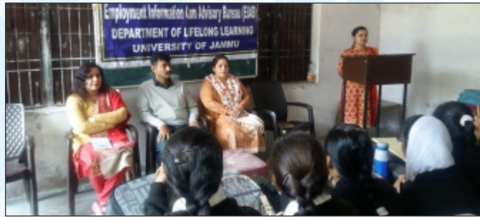
“Career Planning after 12th –II (Arts Stream) at Govt. Girls Hr. Sec. School, Satwari on 29th November 2018 in which 102 students participated.