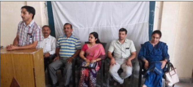
"Careers in Sciences" at Govt. Degree College, Hiranagar on 21st August 2018 in which 100 students participated.

Employment Information cum Advisory Bureau, Department of Lifelong Learning organised following Career Awareness Programmes at different Schools and Colleges during the year 2018-19: