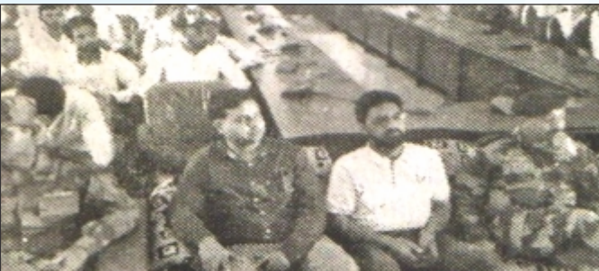
"Career Counselling Programme" at Govt. Degree College, Bhaderwah on 30th August 2018 in which 69 students participated.