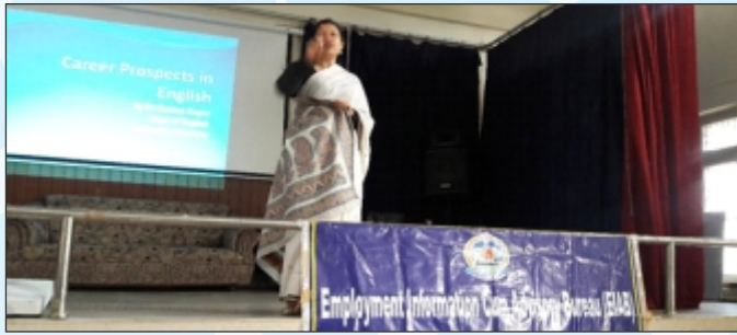
“Careers in Languages and Economics” at Govt. College for Women, Kathua on 30th October 2018 in which 150 students participated.