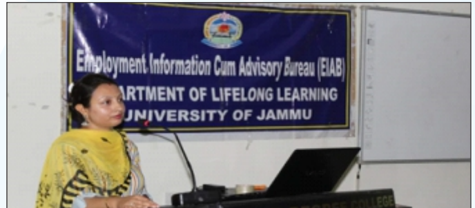
"Career Options in Sciences" at Govt. Degree College, Kathua on 29th August 2018 in which 120 students participated.