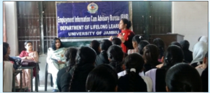
“Career Planning after 12th –I (Science and Commerce) at Govt. Girls Hr. Sec. School, Satwari on 15th November 2018 in which 76 students participated.