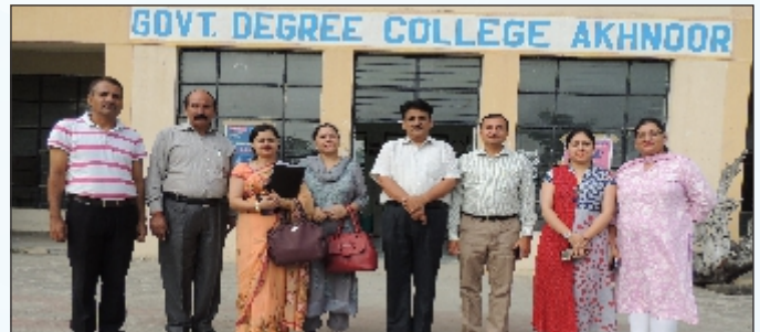
"New and Emerging Fields in Sciences" at Govt. Degree College, Akhnoor on 11th October 2018 in which 105 students participated.