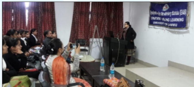
“Career Options in Sciences & Economics” at Govt. College for Women, Udhampur on 5th February 2019 in which 130 students participated.