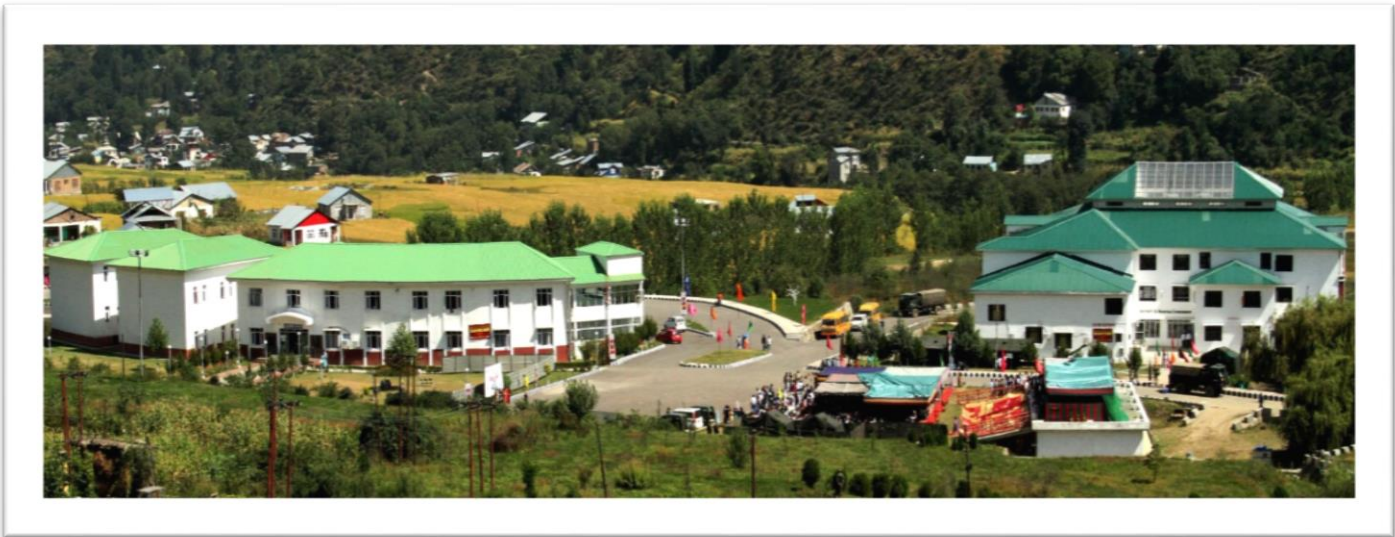
Bhaderwah Campus, University of Jammu