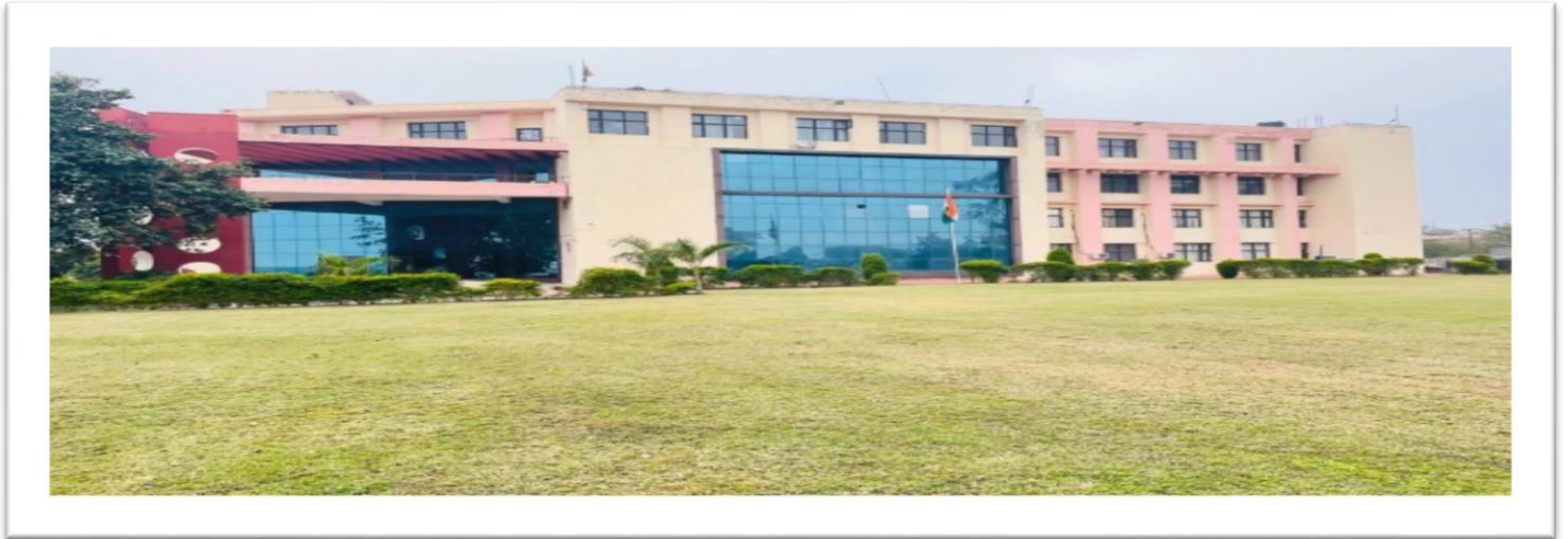
Kathua Campus, University of Jammu