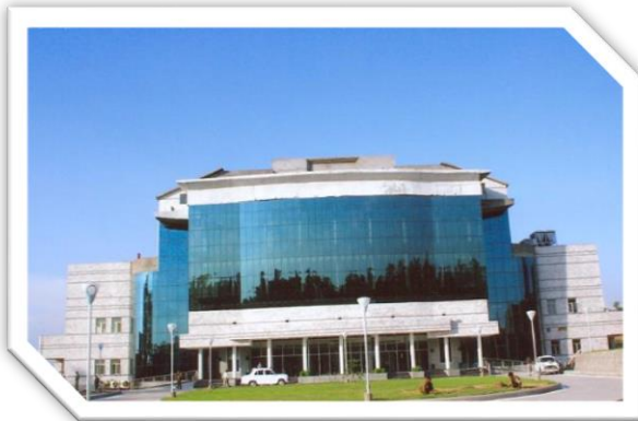
General Zorawar Singh Auditorium