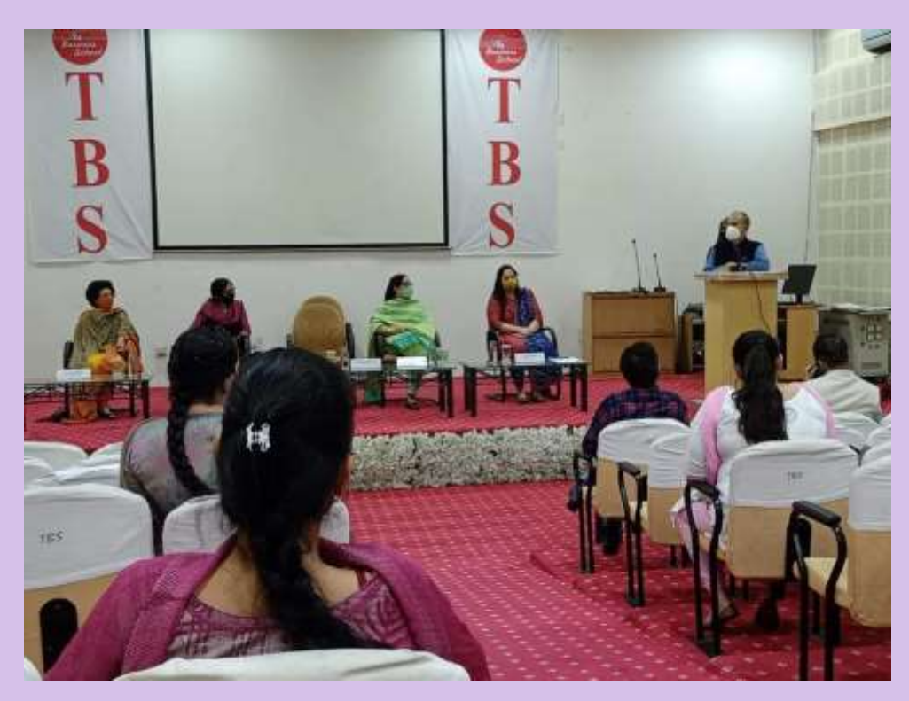
One Week Skill Course On Learning Disabilities Organized in association with University Entrepreneurship & Skill Development Centre, JU