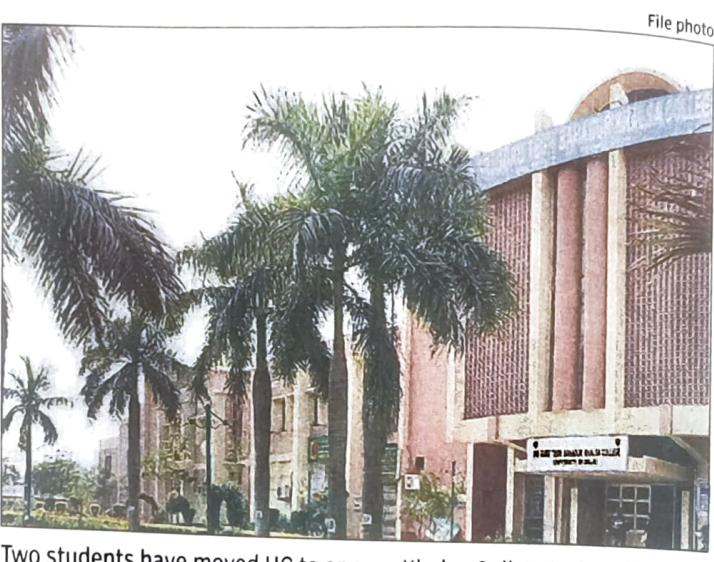
o students have moved HC to oppose Khalsa College's decision