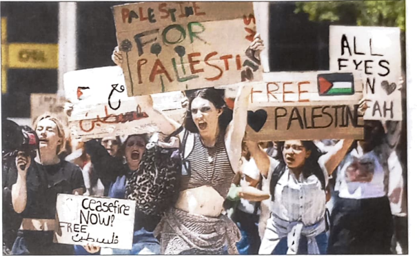
कैलिफोर्निया के एक कॉलेज के बाहर प्रदर्शन करते स्टुडेंट्स

पुलिस बुला ली। छात्रों के खेमे जबरन हटाए लगेगा। लेकिन छात्रों का इरादा चुनावी साल गए तो कुछ तोड़फोड़ भी हुई। लेकिन अगले में देर तक टिकने का है। दिन ये तंब न सिर्फ यहां बल्कि पचास और कैंपसों में वापस गड़ गए। सबसे बड़ी बात यह कॉलेजों का रुख | कोलंबिया रही कि लाख कोशिशों के बाद भी इसे सिर्फ विश्वविद्यालय के उलट जिन विश्वविद्यालयों फलस्तीनी, अरब या मुसलमान छात्रों का का प्रशासन समझाने-बुझाने के रास्ते पर आगे आंदोलन साबित करना संभव नहीं हो पाया बढ़ना चाहता है. उनका कहना है कि इस्राइल