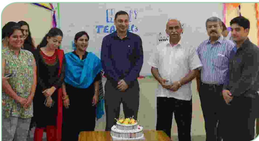
Cake cutting ceremony

Every year SHTM students organise teachers day for teachers in which students participate and perform different activities like dance, singing, Games etc. Teachers also participated in those activities.