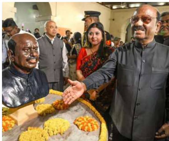
Self-appreciation: West Bengal Governor C.V. Ananda Bose unveils a bust of himself at Raj Bhavan in Kolkata.

"In some media reports it has come out that HG (Honourable Governor) has 'unveiled his own statue' at Raj Bhavan on 23.11.2024. The fact is as follows: many artists submit their artistic creations to HG. Many painters made HG's portraits and presented them to him. Similarly, a creative sculptor had created a sculpture of HG and presented it to HG. This has unfortunately been described as 'unveil-