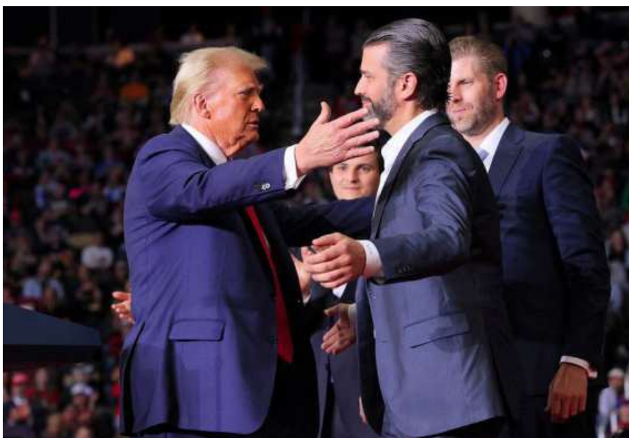
Warm bond: U.S. President-elect Donald Trump approaches to embrace his son Donald Trump Jr. at a campaign rally in Pennsylvania in the run-up to the presidential election.

He will provide advice to his father in the White House, the source added, although they cautioned