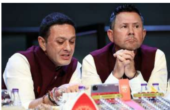
In the game: Punjab Kings head coach Ponting and co-owner Ness Wadia at the IPL auction in Jeddah.

According to the rule, except for a justifiable medical reason, an over-