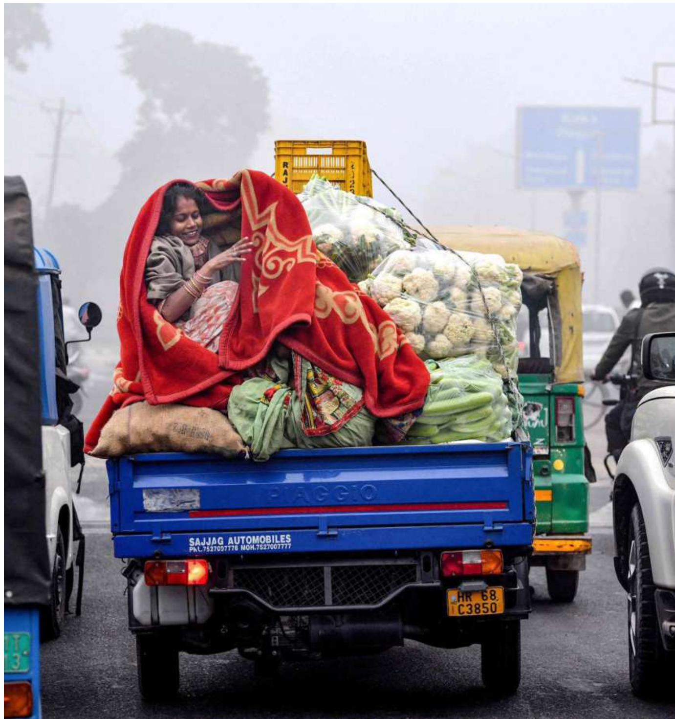
Women riding a vegetable truck cover themselves as early morning smog engulfs a street in Chandigarh on November 13.

Dr. Pant commended the NCAP's role in raising awareness and enhancing air quality monitoring but also called out its shortcomings in sustained, source-specific emission reductions. She suggested instead that a regionalised approach could allow for more targeted, impactful solutions. "The NCAP needs localised strategies focused on specific emission sources," she said.