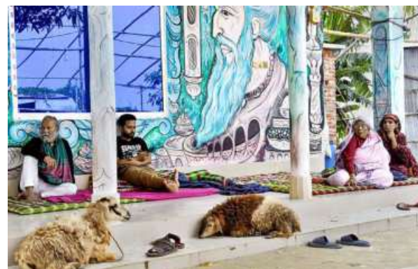
Devotees of social reformer Lalon Shah on the MuktiDham Ashram and Lalon Academy premises in Narayanganj on Friday.

a 17th-century Bengali social reformer whose moving songs of religious tolerance remain hugely influential, had organised a two-day festival in the city of Narayanganj later this month.