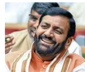
Nayab Singh Saini

"Out of the 20% quota reserved for SCs in direct recruitment in government services, 10% has been reserved for candidates from DSCs. If suitable candidates from DSCs are not available, the remaining vacant posts will be filled from among candidates from Other Scheduled Castes. Similarly, if suitable candidates from other Scheduled Castes are not available, candidates