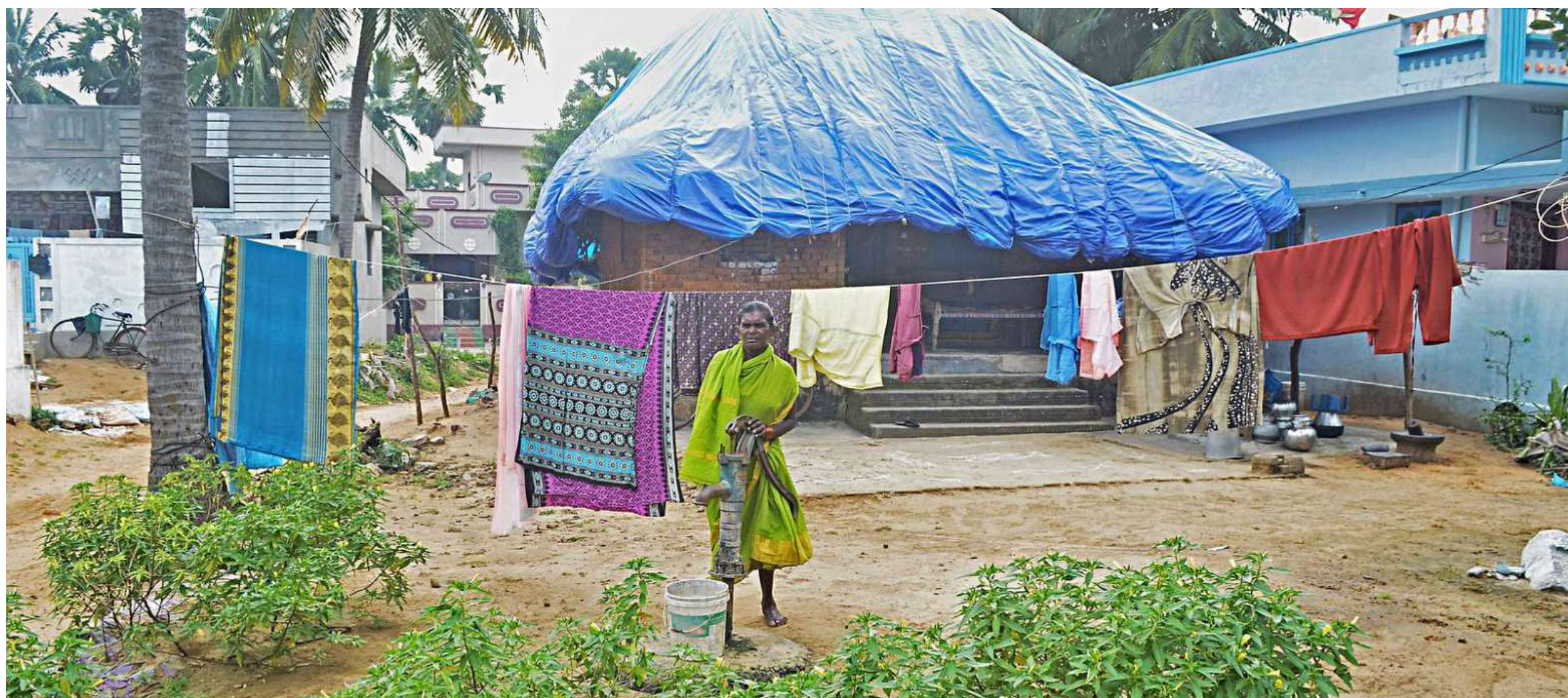
Blighted by customs: At least 25 children born to couples who had consanguineous marriages suffer from various mental and physical disorders at Srirampuram village of Uppada-Kottapalli mandal in Kakinada district, Andhra Pradesh. T. APPALA NAIDU