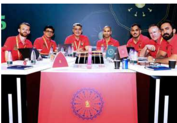
Vignettes from Jeddah: The Super Kings camp strikes a happy pose while Bravo makes his presence felt at the KKR table. RCB will have a busy day on Monday.