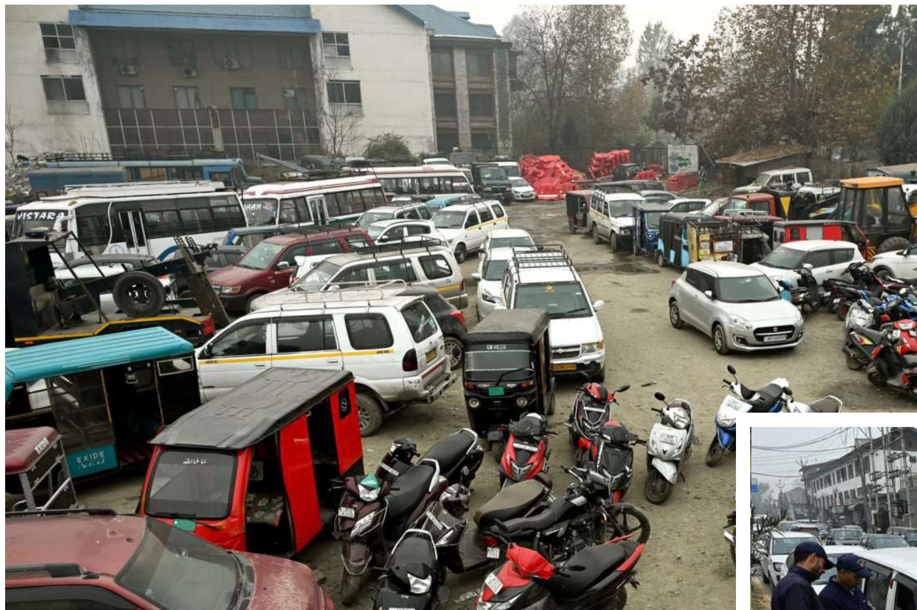
Seized vehicles inside the parking lot of the traffic department in Srinagar, Jammu and Kashmir's summer capital, during an ongoing drive to curb underage driving, in the wake of rising car crashes and accidents; (below) on-road checking to ensure all traffic rules are being followed.