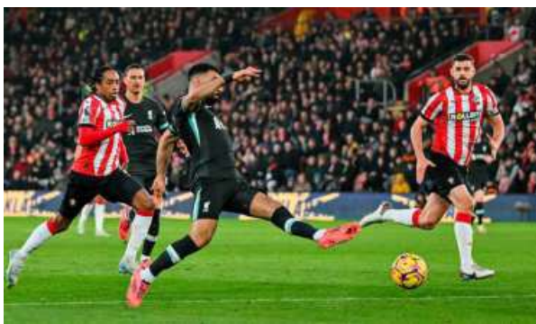
Two-goal hero: Salah pokes home Liverpool's second against Southampton.

suffered a dramatic collapse in a 2-2 draw at Celta Vigo on Saturday. The results: Premier League: Southampton 2 (Armstrong 42, Fernandes 56) lost to Liverpool 3 (Szoboszlai 30, Salah 65, 83-pen); Ipswich 1 (Hutchinson 43) drew with Manchester United 1 (Rashford 2).