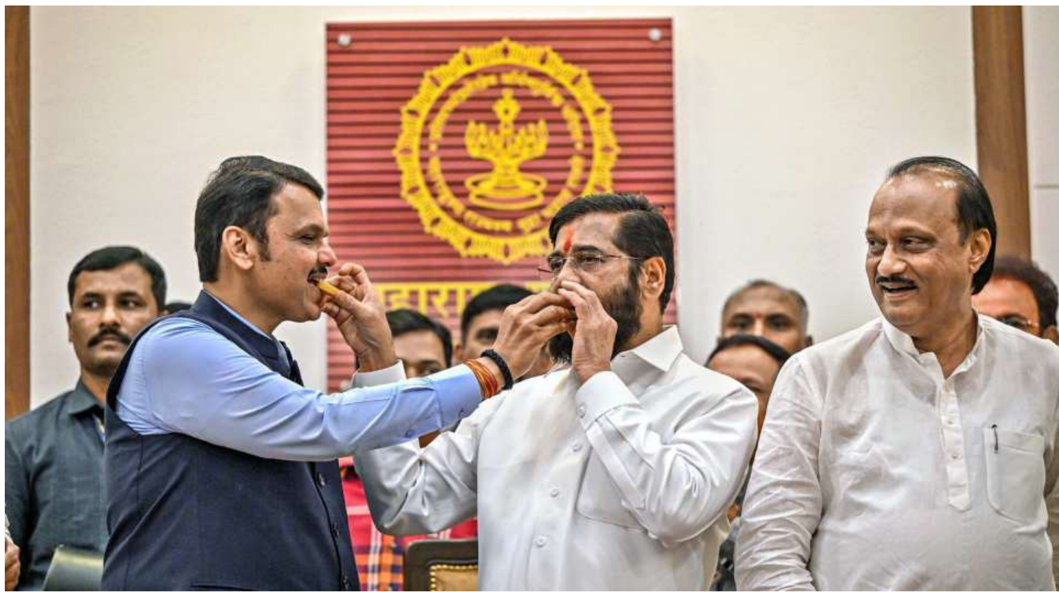
Savouring a win: (from left): Devendra Fadnis, Eknath Shinde, and Ajit Pawar celebrate the Mahayuti's victory, in Mumbai.

Two elementary points need to be noted at the outset. First, between the two alliances – the Mahayuti and the Maha Vikas Aghadi (MVA) – managing and ironing out differences in seat-sharing appeared to have been handled better by the Mahayuti than the MVA. Further, during the campaign, the BJP and the