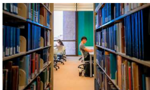
Full throttle: The push from non-banking finance companies is also driving the growth in education loans.

"After robust growth of over 80% and 70% in fiscals 2023 and 2024, respective-