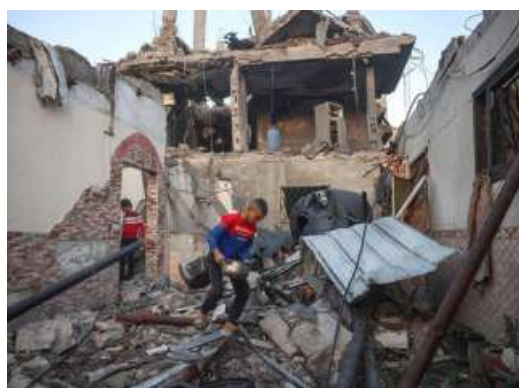
Everyday items like cups and bowls have often been lost, broken, or left behind to perish in war-ravaged Gaza.