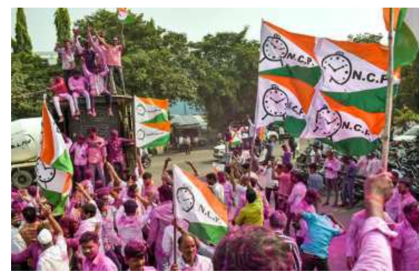
Victory bash: NCP supporters celebrate the party's win in the Assembly election in Baramati on Saturday.

It is also important as the entire Pawar family, in-