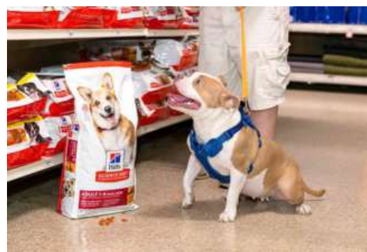
Money spinner: India's pet food and nutrition market is estimated to be about $800 million.