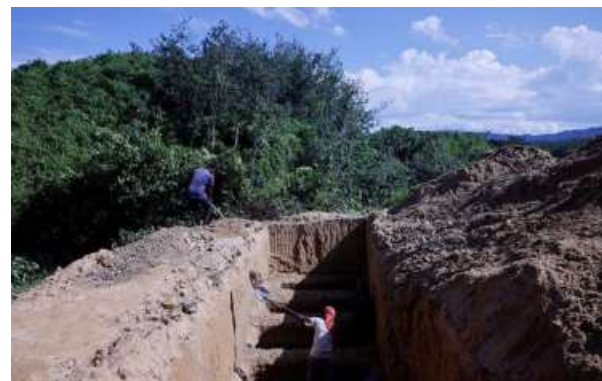
Graves dug for members of a family who were abducted and killed after an encounter in Jiribam of Manipur on November 11.

The boy's 25-year-old mother had two bullet wounds on her back, while his 60-year-old grandmother had five bullet wounds.