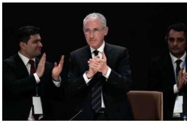
Winding up: COP29 President Mukhtar Babayev applauds during the closing plenary session in Baku on Sunday.

However, this conclusion did little to placate several countries who were expecting much more money. A member of the Indian delegation publicly voiced her objections at the closing plenary of the summit. This was acknowledged by the President of the COP, Mukhtar Babayev, only after he had ceremoniously slammed the gavel declaring the end of discussions on the finance aspects. The objection will,