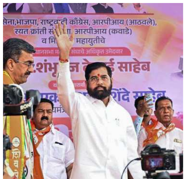
Maharashtra Chief Minister Eknath Shinde during a public meeting before the Maharashtra Assembly election. The Mahayuti alliance registered a massive victory.