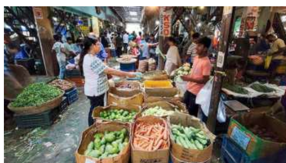
Inflation emerged as the dominant concern, with a quarter of voters identifying it as the key issue influencing their vote. PTI

five pointed to the Union government alone. A similar trend was observed with unemployment, where one third voters felt job opportunities had decreased. However, a clear majority—three-fifths of