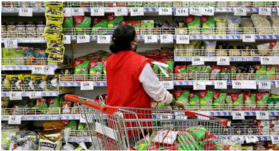
Delivering growth: For most FMCG companies, quick commerce has emerged as the fastest growing channel and is leading the online channel growth.