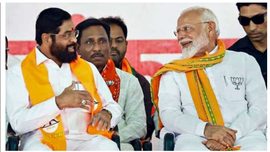
A strong tilt of voters who support the 'double-engine government' worked in favour of the Mahayuti.