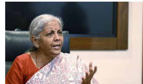
The Minister's remarks came against the backdrop of objections raised to a notification issued by the ICAI.