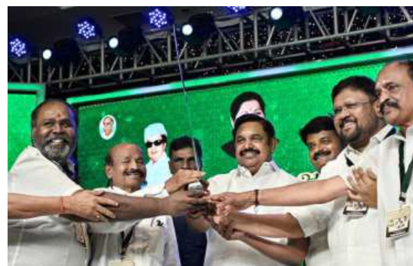
AIADMK leader Edappadi K. Palaniswami at the birth centenary celebrations of Janaki Ramachandran on Sunday.

Delivering an address at the birth centenary celebrations of late AIADMK leader and former Chief Minister Janaki Ramachandran, Mr. Palaniswami said no party had won or lost elections continuously. "Victory and loss come in turns..."