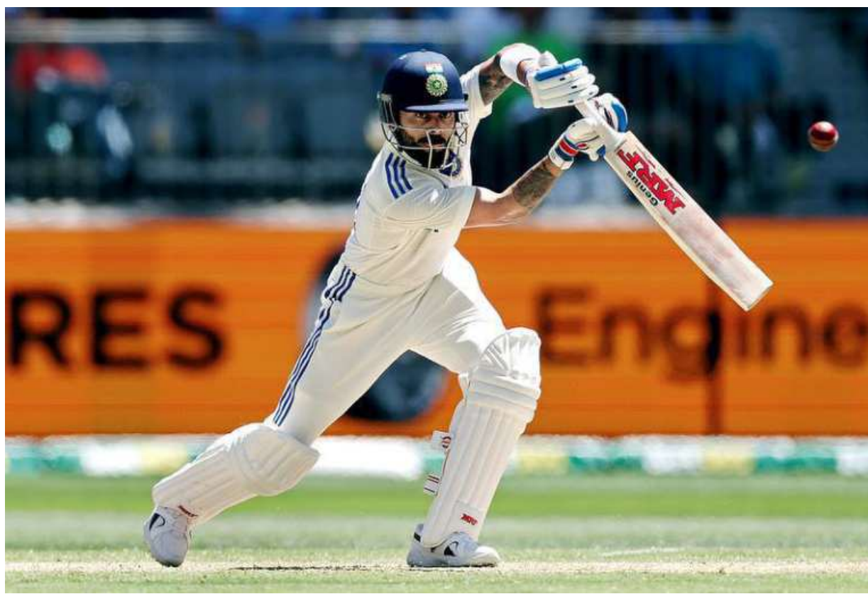
Record-breaker: Kohli returned to form with his seventh century on Australian soil, the most by an Indian batter surpassing Tendulkar.

taken, a change in fortunes was inevitable. Rahul edged Hazlewood and departed for a fine 77 and by then the opening alliance yielded 201 runs. Next man Devdutt Padikkal proved to be an apt foil while Jaiswal tucked into Nathan Lyon and India sat pretty on 275 for one at lunch.