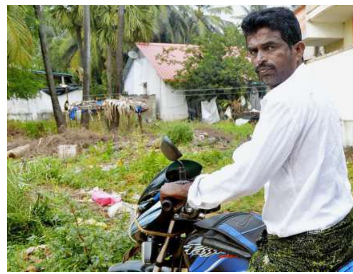
The parent of a child who suffers from albinism, at Srirampuram.

The grim reality of the unhealthy custom re-