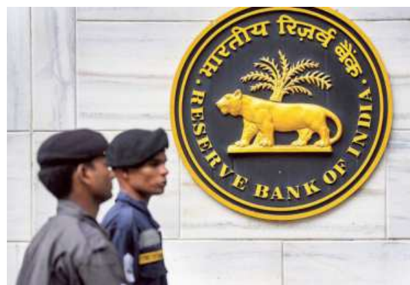
Regulator's caution: The RBI is nudging NBFCs to focus on long-term sustainability to avert stress in any segment. PTI

Private-sector NBFCs mopped up ₹1.91 lakh crore, nearly unchanged