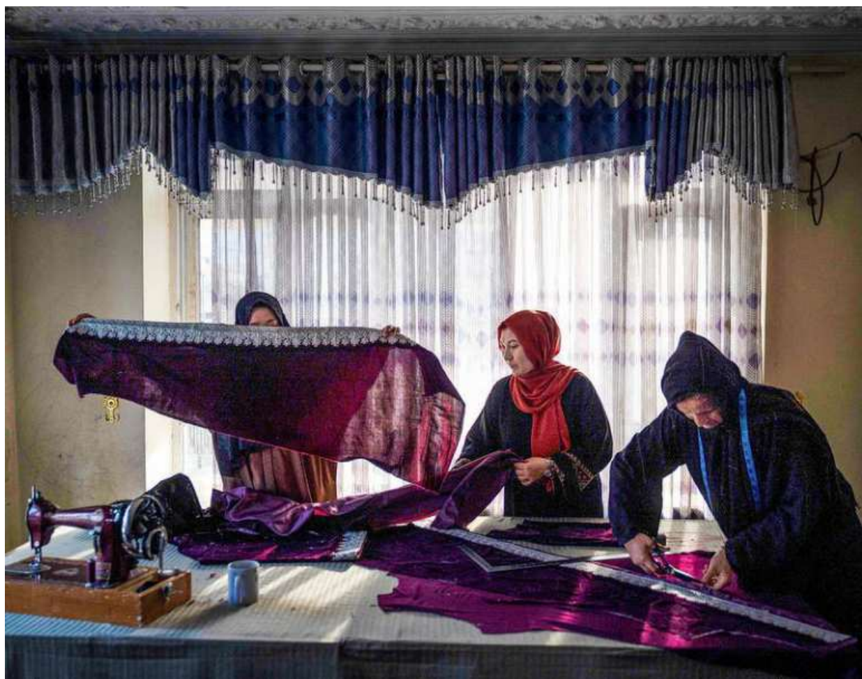
Afghan women sew clothes at a handicrafts workshop in Kabul. Many women have launched small businesses in the past three years to meet their needs and support other women, whose employment sharply declined after the Taliban regime returned to power in 2021.