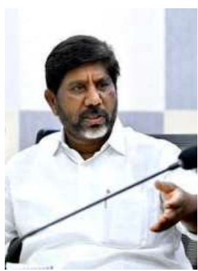
Mallu Bhatti Vikramarka

He made these remarks while chairing a video conference with the Principal Secretaries of Finance and Education, the Commissioner of the Greater Hyderabad Municipal Corporation (GHMC) and all District Collectors from