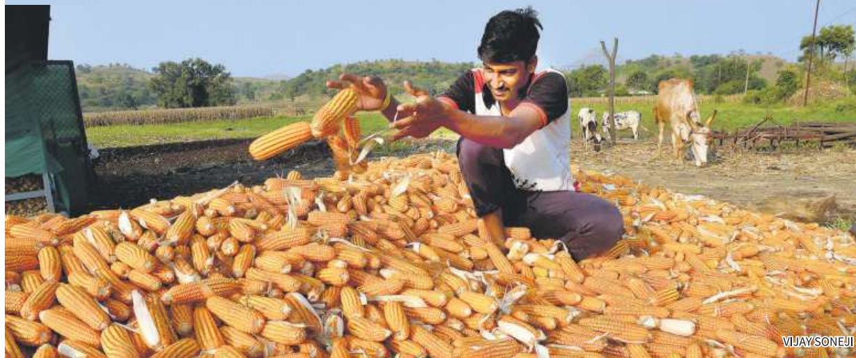
Table 2: Welfare schemes for farmers produced positive results

Welfare schemes designed to support farmers, especially those introduced by the Central government, played a crucial