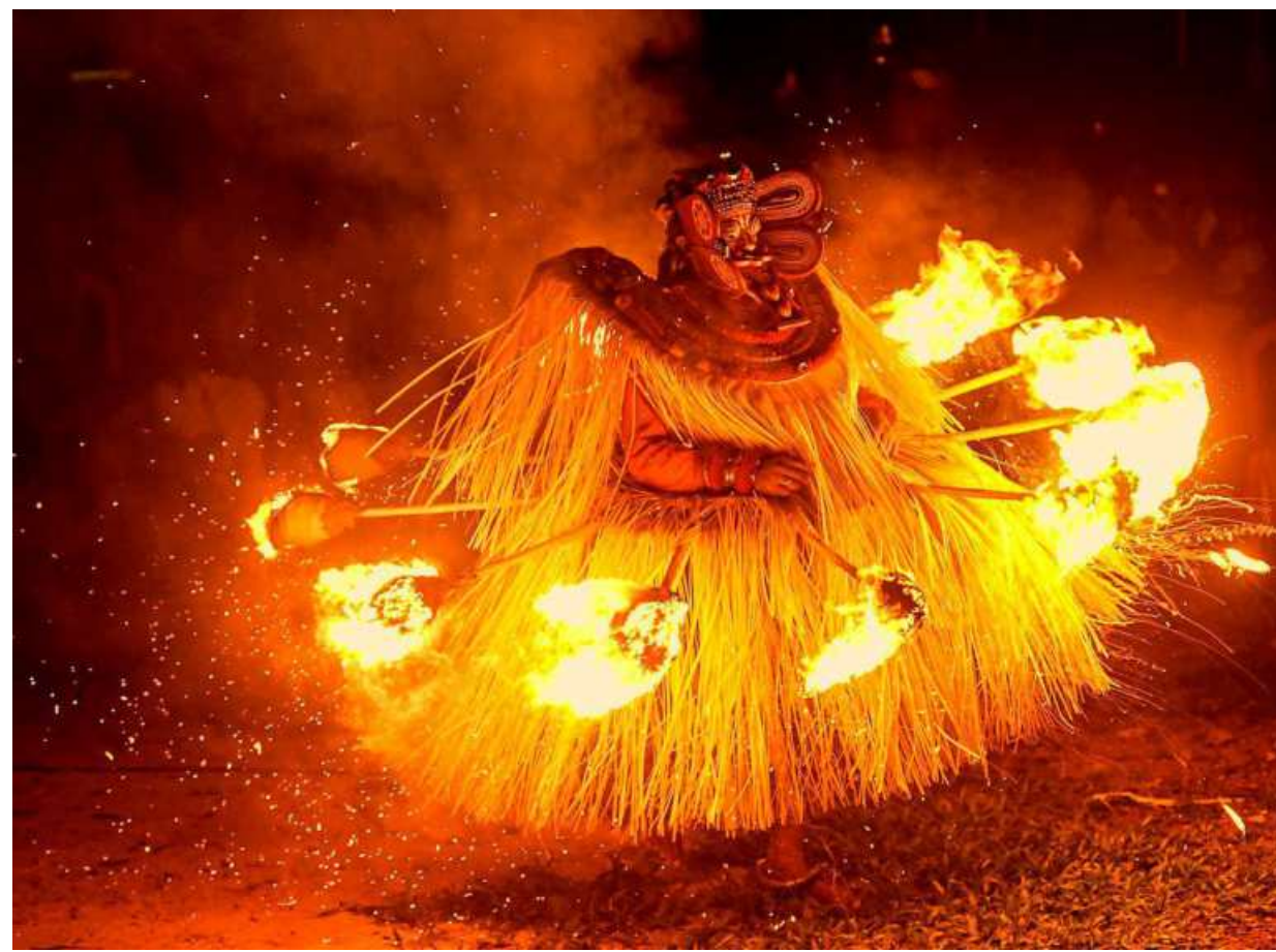
Stage ablaze: An artist performs Kandakarnam Thirra, a traditional ritual art form, in Kozhikode district of Kerala on Sunday.