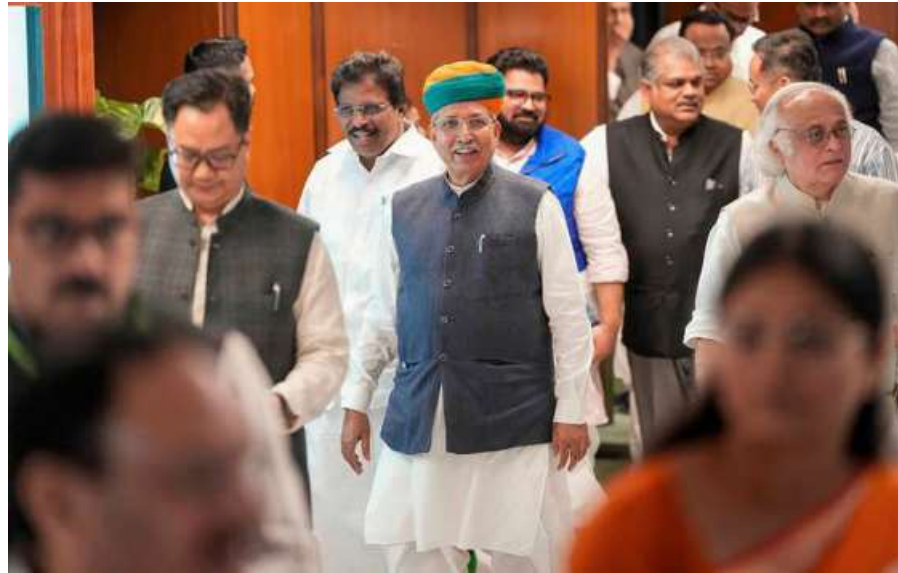
Fired up: Kiren Rijiju, Arjun Ram Meghwal, Jairam Ramesh and others leave after an all-party meeting in New Delhi on Sunday ahead of the Winter Session of Parliament.

While the Opposition is preparing to attack the government, there are indications of cracks within its ranks. Congress president and Leader of the Opposition in the Rajya Sabha Mallikarjun Kharge has invited the floor leaders of the INDIA bloc parties for a meeting at 10 a.m. on Monday to take a call on whether the group should attend the November 26 joint parliamentary session to commemorate the 75th anni-