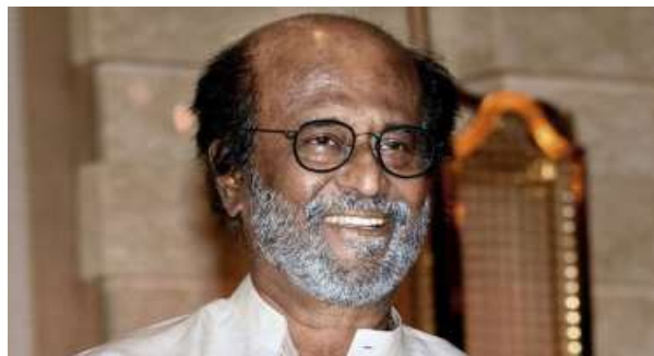
Actor Rajinikanth lauded Janaki Ramachandran for not having listened to any advice and taking her own decision.

"I had said in 2017 that I will enter politics. After that, I met so many people, and many came to advise me. If I had to listen to all of them, that was it, I would have lost my peace. I do not know if they actually knew what they were talking about," Rajini-