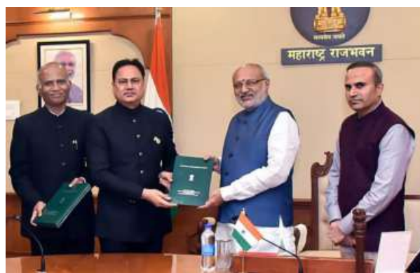
Election Commission officials hand over the names of MLAs-elect to Governor C. P. Radhakrishnan in Mumbai on Sunday.

The Nationalist Congress Party (NCP) and the Shiv Sena elected Eknath Shinde and Ajit Pawar as their group leaders, respectively, at meetings of