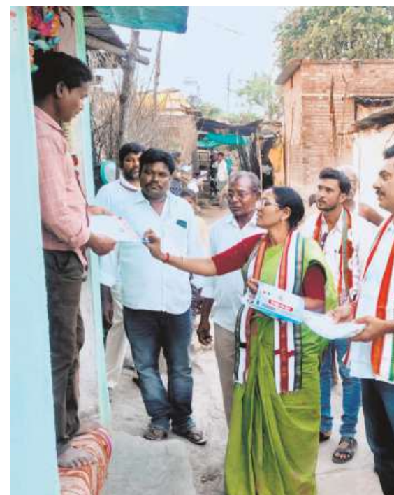
Table 1: Party outreach and campaign visits for votes in the last month (%)

Approximately half (46%) of voters made their choices late in the campaign, while three in ten (30%) decided during the campaign, reflecting an electorate that remained undecided until the campaign began. It also underscored the importance of campaigns in influencing voter decisions. Only one-fifth (18%) of voters were early deciders.