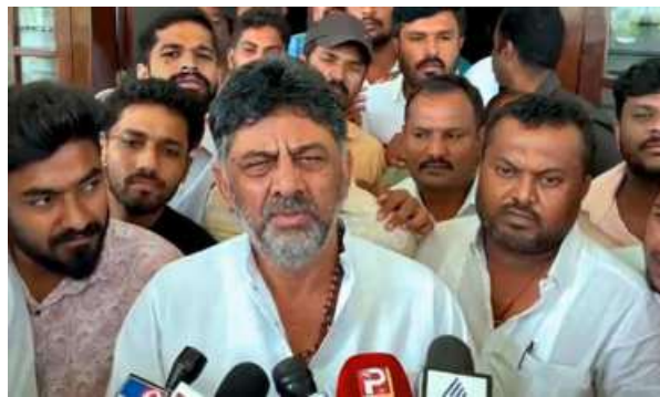
Deputy Chief Minister D.K. Shivakumar addressing the media in Bengaluru on Sunday.