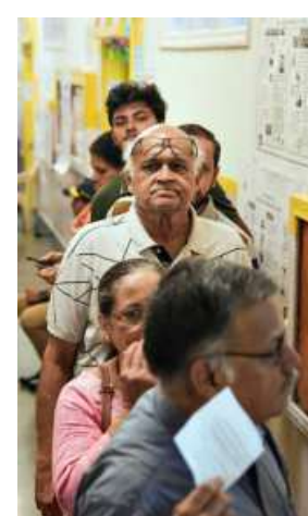
The survey finds that those who did not benefit have also voted for the ruling alliance.