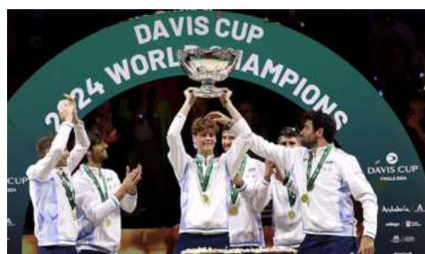
Reign continues: Sinner raises the coveted Davis Cup following Italy's successful defence.