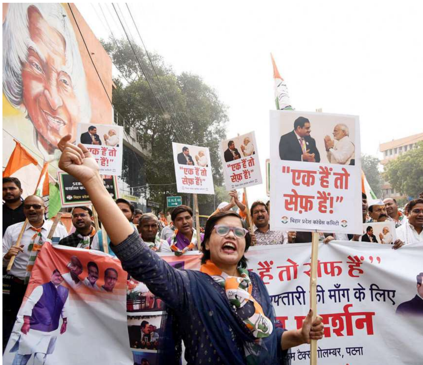
In rage: Congress members stage a protest against Gautam Adani over his role in an alleged multibillion-dollar bribery case, in Patna on November 24.

The indictment accuses Adani and his associates of conspiring to bribe Indian