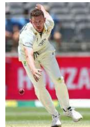
Hazlewood.

It was hard work out there, says Hazlewood