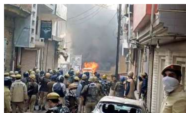
Police and paramilitary personnel at the site of the protest near the Shahi Jama Masjid in Sambhal, Uttar Pradesh, on Sunday.

The mosque was first surveyed on November 19 after court orders.