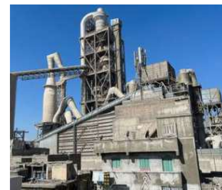
Titan Cement's Alexandria Portland Cement Company factory in the Mediterranean city of Alexandria, Egypt.