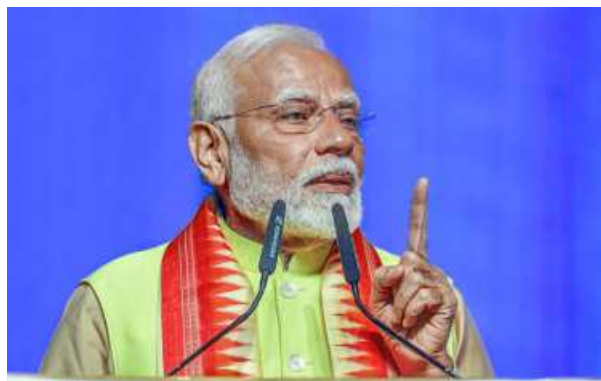
Narendra Modi said that many special campaigns will be run to connect 1 lakh youth to politics.

Prime Minister Narendra Modi on Sunday said the Viksit Bharat Young Leaders Dialogue would be organised in New Delhi on January 11 and 12 as part of efforts to connect youth from non-political backgrounds to politics. The event will mark the birth anniversary of Swami Vivekananda on January 12, celebrated as Youth Day.