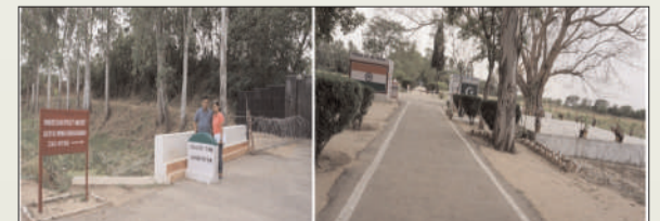
Images show the snapshot of the historic Octroi border post at the International border Suchetgarh

e) Octroi Post: Suchetgarh- Octroi border post, has been developed as a tourism spot by the Tourism Department. The Suchetgarh Border post is approximately 28 km from the main Jammu city. The spot was used for inter-regional trade centers from Jammu to Sialkot and the Chungi (octroi/duty) was levied on items while entering other cities or towns). Since then it has been known as octroi post. Sialkot city is 11 km and Lahore is 141 km from Suchetgarh- Octroi post. The tourism department has developed it as a site for a retreat ceremony. It is a living example of cross-border harmony where the historic significance of the cross-cultural trade post is preserved in the form of cultural programs.