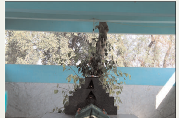
Mazar of Baba Neeli Tali Wala

Baba Neeli Tali Wala: It is believed that the Sufi shrine had its existence before Independence and is presently maintained by Dharmarth Trust Jammu. It is located on the Indo-Pak borderline in Suchetgarh village.