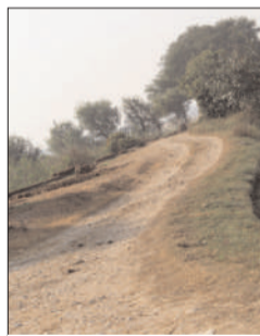
Image of historic Jammu-Sialkot Railway line track at Suchetgarh station that is now under its encroached status