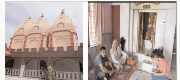
Snapshot of Pajjal Kuldevi's temple structure's exterior façade and interior deity's sathan and a glimpse of talk with dayala/chela (believed to be deity's messenger among local folk)

Pajjal Devsthan: The term 'pajjal' refers to a local folk clan name of Jat refugees of PoJK. The temple is located at Gharani village. It is dedicated to three folk deities: Bua Mani, Baba Porakh and Baba Sona Shaheed ji. The beauty of this folk religious place is that people of every faith come and offer their prayers. Every Sunday, devotees organize Langar irrespective of caste. It stands as a fine example of harmony and peace between folk heritage and diverse communities.