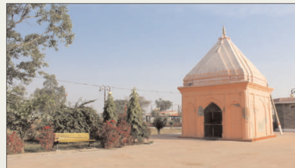
Ancient Hanumanji temple

Ancient Hanumanji temple: In front of the Raghunath ji temple complex is the ancient temple of Hanuman ji having a huge statue of the God Hanuman and a high bell.