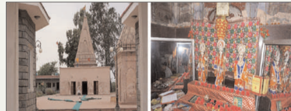
Images of the exterior and interior structure of the Raghunath Ji temple complex.