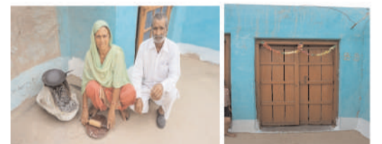
Portable Chulhas(stove) and traditional cooking ways demonstrated by local folks and at right side a view of traditional wooden door at Kapoorpur village