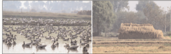
A Glimpse of Bar-headed geese at Gharana Wetland and Basmati rice fields

tober to March. According to J&K Wildlife Department officials over 50 species of the bar-headed Geese, including some rare and endangered species, every year fly a distance of more than 1000 miles over the Himalayas in a single day to reach here from their breeding grounds in Central Asia and other parts of the World. It has been notified as a protected waterbody and declared an Important Bird Area (IBA). It is being promoted as a significant ecotourism destination.