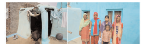
Images from left to right are of a megh family of Kapoorpur who are a living example of traditional folk lifestyle. They have survived their cultural heritage in the form of their tangible assets as well as intangible attributes.

The cultural as well as natural heritage of Suchetgarh thus, serves as a powerful tool for peacebuilding by fostering community engagement, promoting resilience through shared narratives, and facilitating educational initiatives that encourage dialogue and understanding among diverse groups. 'Heritage for peace' is a call to action to see cultural heritage not just as a relic, but as a vital resource for fostering connection and well-being. Embracing this mission, and peace is woven into the very fabric of our shared history. Recently the University of Jammu organized a community outreach program on the occasion of 'World Tourism Day' on the theme 'Tourism and Peace' aimed at fostering community engagement and raising awareness on the role of tourism and promoting peace.