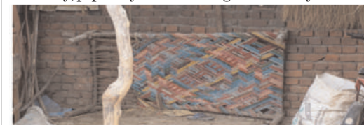
Image of folk bunk bed- Khat/manji/manja

The skills of natural buildings, crafts, and handicrafts which traditionally were handed down from generation to generation have almost disappeared. However traditional living of the locals at the Kapoorpur village of Suchetgarh tehsil has been preserved. This borderline village is a living example of traditional Dogra rural folk of the Jammu region. The local folk are still promoting a unique way of traditional living in the era of globalization. Here we still find glimpses of vernacular mud houses, traditional cooking manners, their cultural belief systems, and artifacts like portable stoves, khat, tokris, shattis etc. This village comprises of several sub-castes of Dogra culture like meghs. The people here have developed their sense of belongingness which has taken the shape of deities in their own houses individually, popularly known among them as hatya.