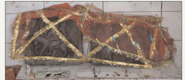
Smotra Vansh's clan temple and Kul Devta's moharas (stone sculptures meant to worship Kul Devta/ Kul Devi in Duggar land of Jammu region)

Smotra Vansh Temple dedicated to a Smotra clan: The temple is dedicated to Baba Kalpir ji, Raja Mandlik ji, Baba Banka Shaheed Ji, Baba Ram Singh Ji, Mata Sati Ji and Mata Dhali ji. These deities are believed to be protectors of the Samotra clan. Mels are prominent features of the temple.