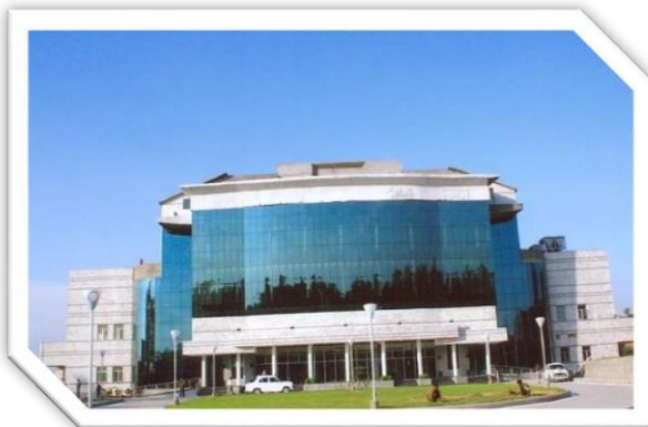
General Zorawar Singh Auditorium