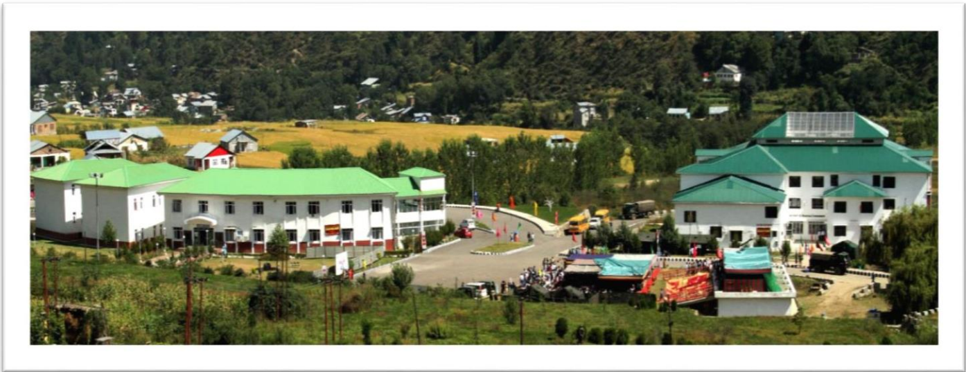
Bhaderwah Campus, University of Jammu