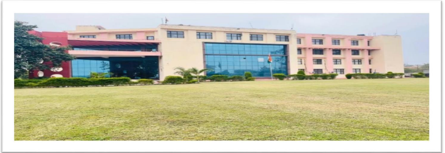
Kathua Campus, University of Jammu